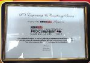
"Silicon India Award 2017"