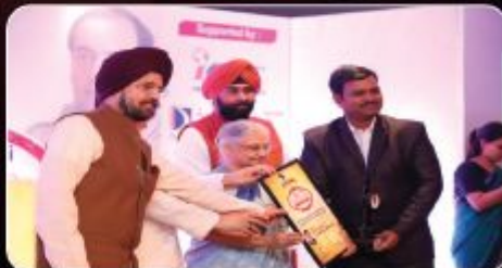
"Rajiv Gandhi Excellence Award-2017 "