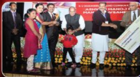
"National Entrepreneurship Award-2016 from Government of India"