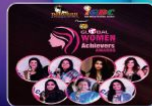
"Global Woman Achiever Award-2017 "